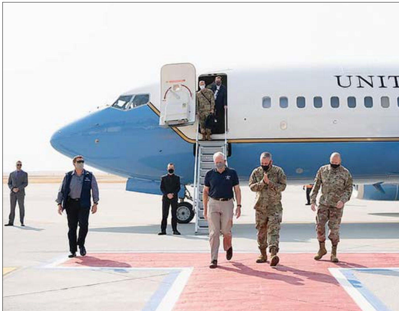
Secretary of the Air Force Frank Kendall walks on the runway at Travis Air Force Base, California, Monday, Aug. 16, 2021. Kendall stopped to have his aircraft refueled and took time to meet with base leadership.